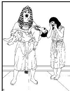
CHRONOLOGICAL PICTURE NO. 28, "PHARAOH AND HIS DEAD SON"

Every firstborn Egyptian child and the firstborn of all the Egyptians' livestock died.