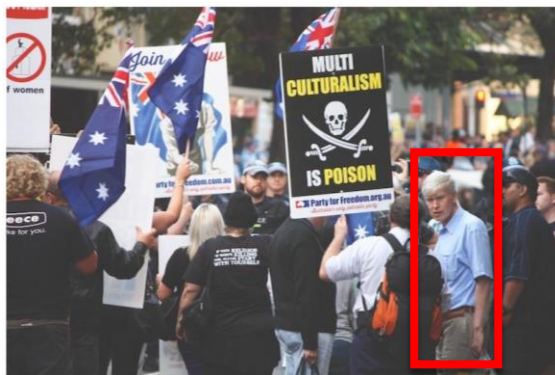
Meanwhile, anti-Islam protesters and anti-racism protesters faced off outside